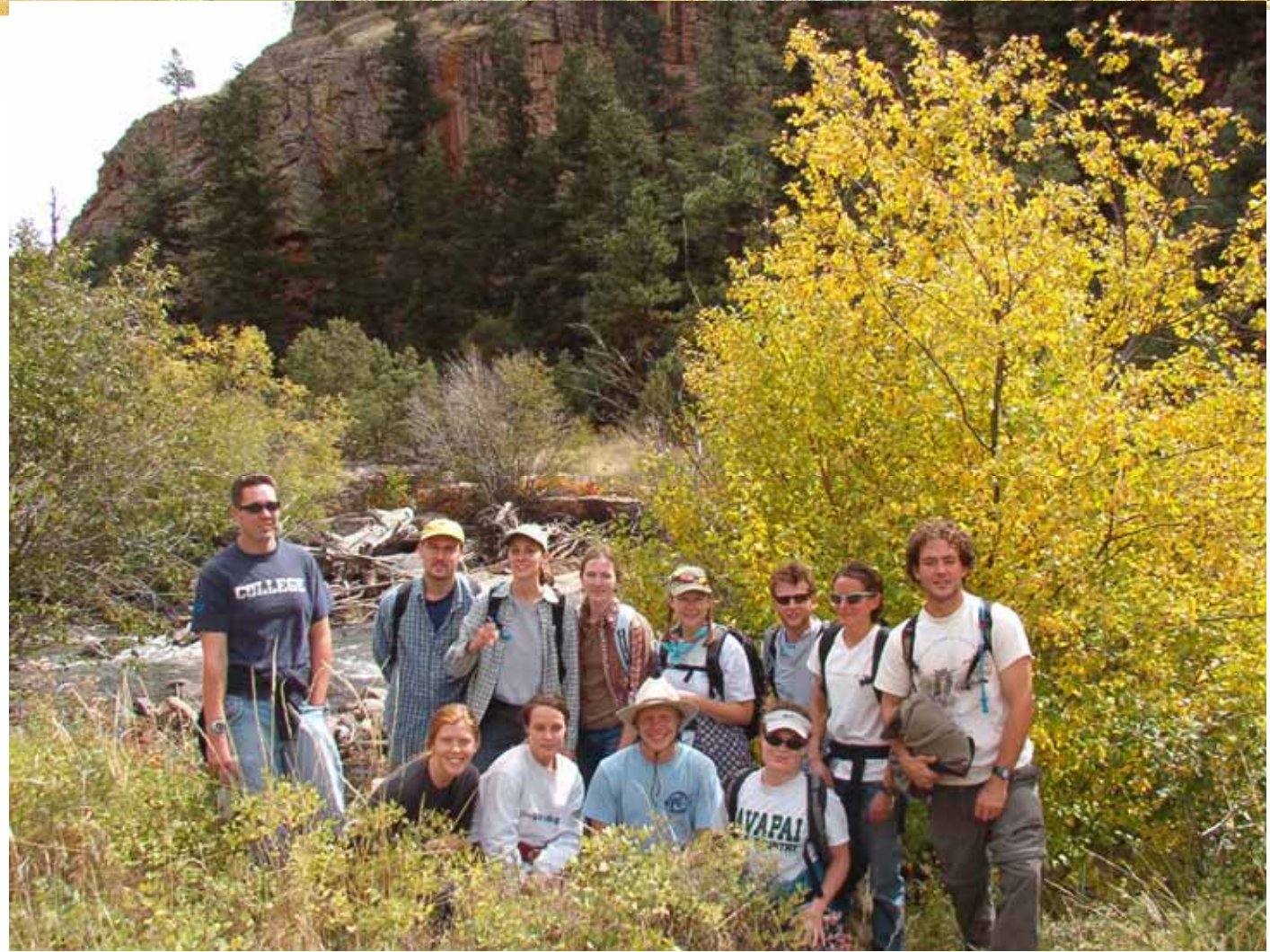
SCB field trip to The Nature Conservancy's Phantom Canyon Preserve