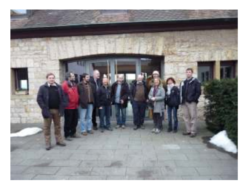
The BoD in Freiburg, February 2010

The mission of the Europe Section is to promote conservation biology and its application to conserve Europe's biological diversity.