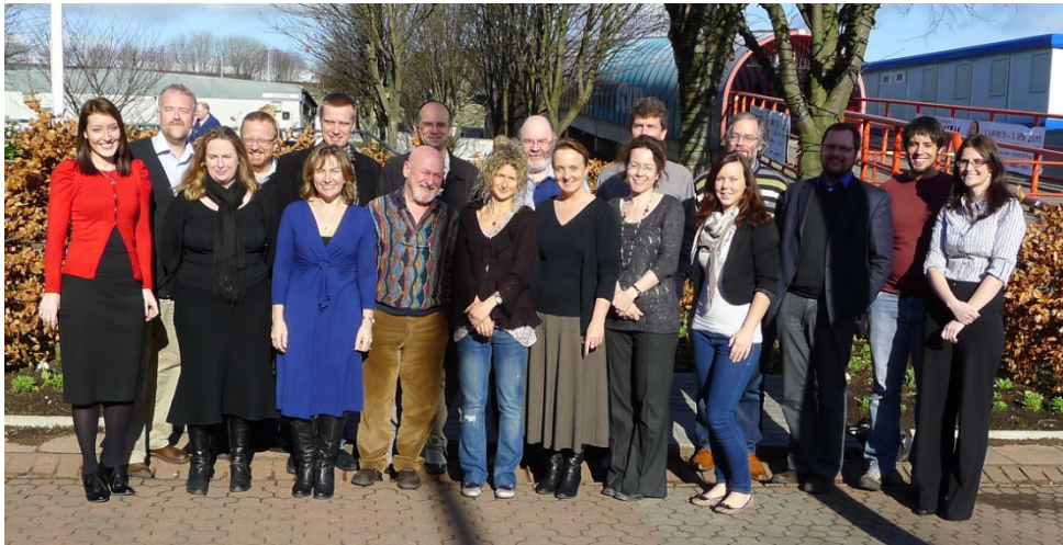
The Board of Directors and the Local Organizing Committee of ECCB2012 in Glasgow, February 2011

The mission of the Europe Section is to promote conservation biology and its application to conserve Europe's biological diversity.