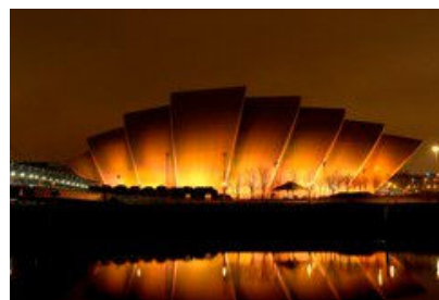
Venue of the Congress – Scottish Exhibition and Conference Centre (SECC)