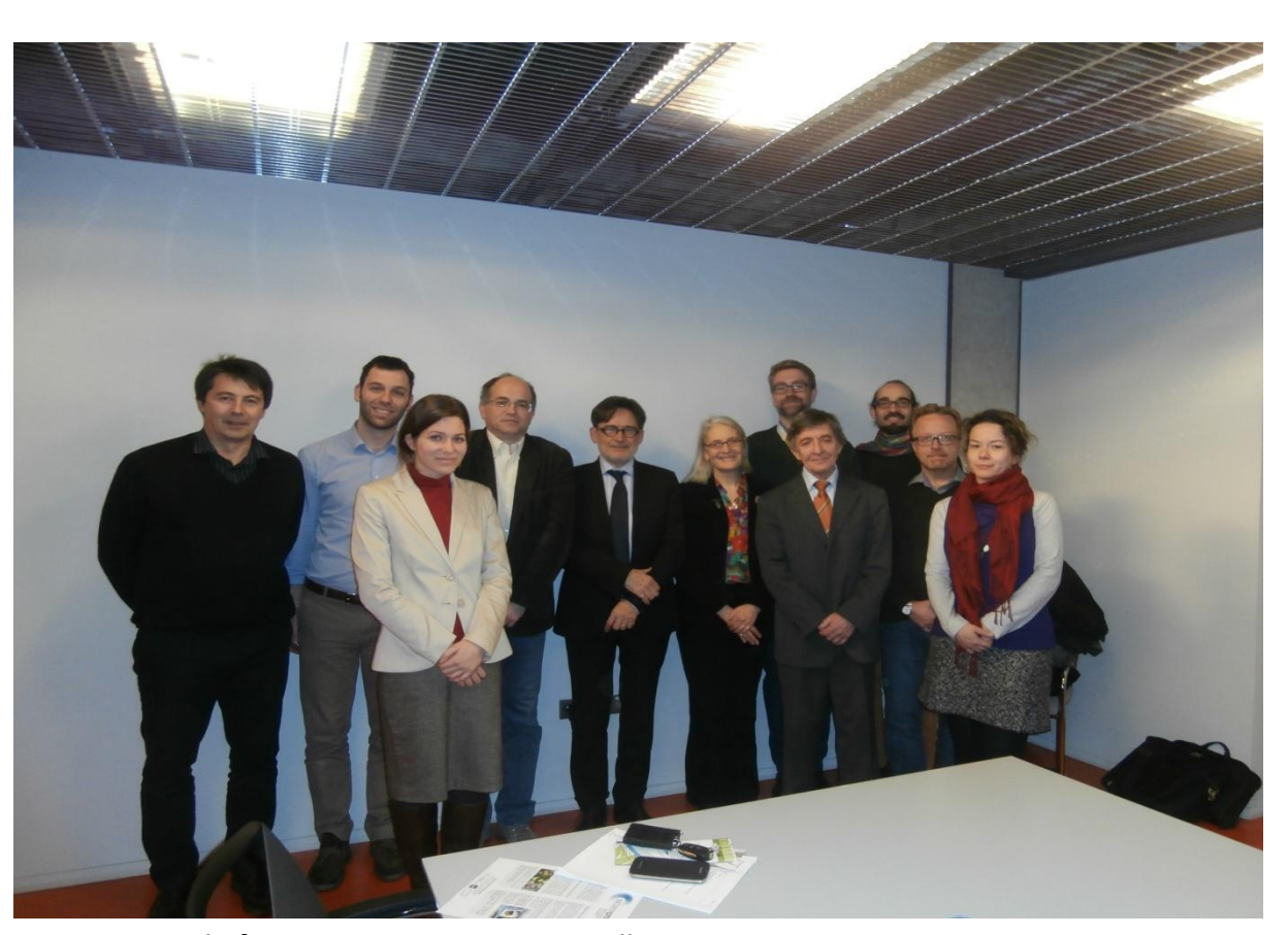
SCB-ES Board of Directors meeting, Montpellier, France, 2014.

The mission of the Europe Section is to promote conservation biology and its application to conserve Europe's biological diversity.