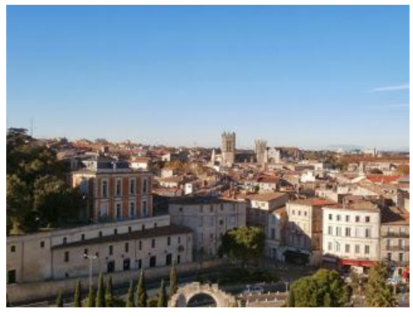
View of the old city from the top of the venue.

For more information visit the website: http://www.iccb-eccb2015.org/