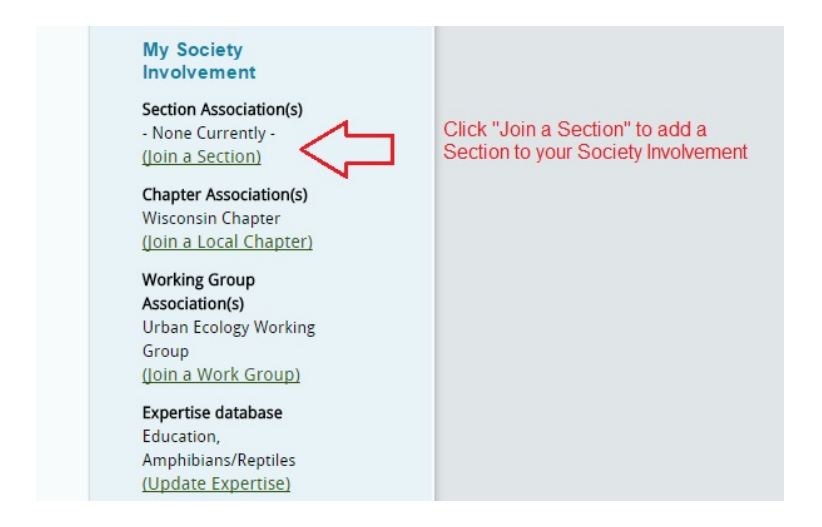
Access My Society Involvement from your SCB Member home page

3. "Join a Section" takes you to SCB Groups tab of "Edit My Member Information." Select the Section you want to join in the Sections drop down menu. Click on "Add" after you select your Section.