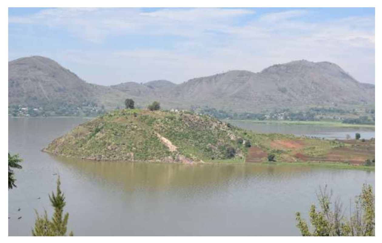
Fig 1. Lake Itasy from the west bank

The Itasy Region has more than 68 natural lakes, and this study focused on Lake Itasy with an estimated surface area of 3,500 ha (Fig 1), about 130 km to the west of Antananarivo. In November-December 2019, we surveyed 133 fishermen operating on the lake. The demographic structure of the fishing communities and their social organisation was characterized.