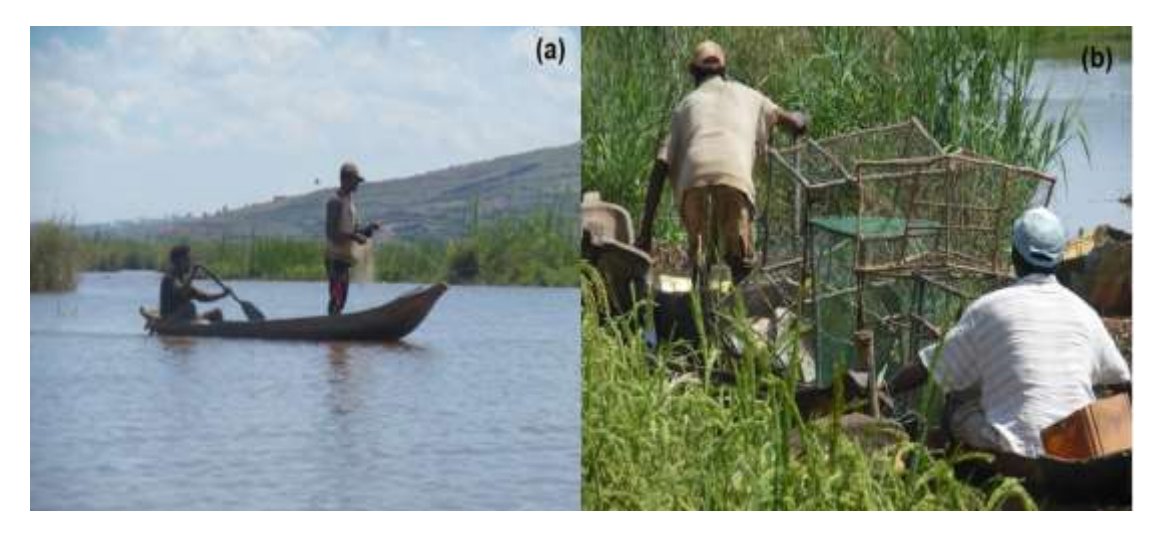
Fig 2. Sample of fishing techniques: (a) Fishers using gill net, (b) traps 'installation

Usually two fishermen go fishing and as one drives the pirogue, the other catches the fish. They go fishing twice a day: in the morning from 7 to 11 am and in the afternoon from 1 to 5 pm. Their catches varied from 5 to 6 kg of fish per day. To increase the catch, some of them go out at night (5%). The most caught species include tilapia (83%) ( Coptodon rendalli, Coptodon zilii, Oreochromis niloticus and Oreochromis mossambicus ) and carp (16%) ( Ciprinus carpio ). Other species rarely caught (1%) are ( Micropterus salmoides, Ratsirakia sp., Awaous aenofuscus, and Anguilla marmota ) or absent ( Paratilapia polleni and Ptychochromoides itasy ). Small fish species namely Xyphophorus helleri and Gambusia holbrooki are collected by women using mosquito nets (Fig 3).