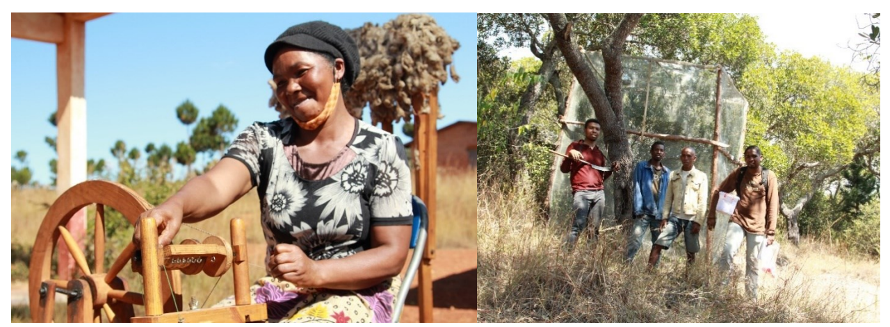
Figure 2. Weaver and students with local assistant near the breeding cage

Differences between the two sites can be explained by habitat quality and the fire history. With efforts from the COBA and AMAFI, these factors were controlled during the implementation of the cages. This method's success is well studied too by Mattoni, Longcore et al. (2003). These findings highlighted the importance of empirical experiments to respond to the community's needs and lack of education. Applied research must go beyond experimentation for knowledge generation (Abrami and Bernard 2006).