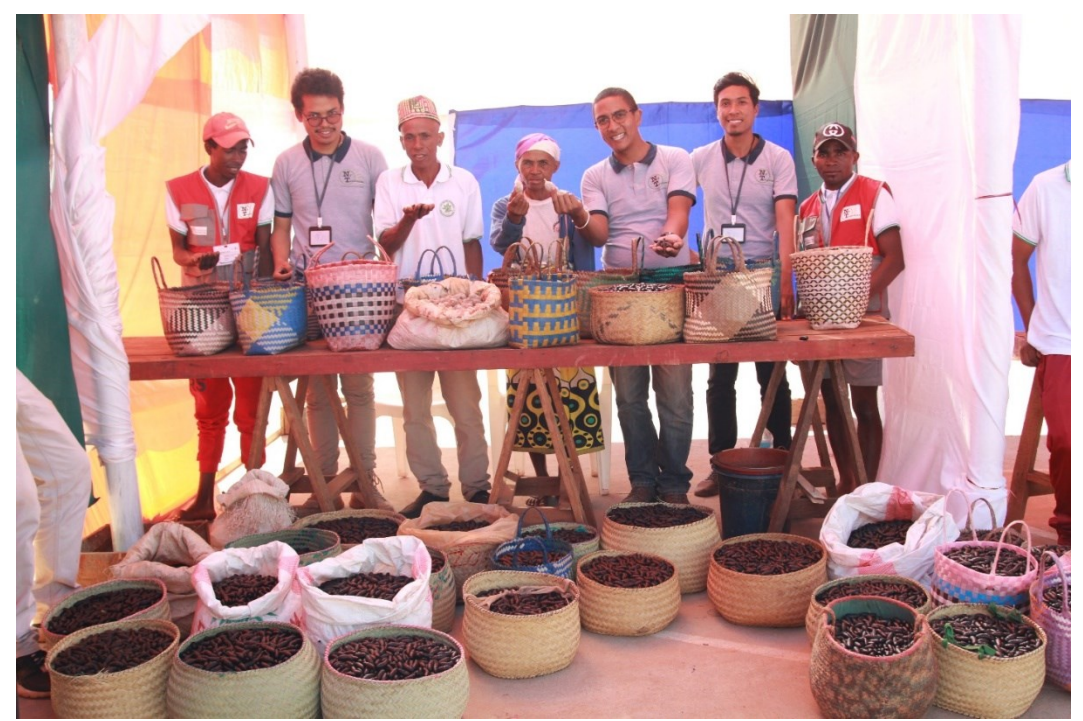
Figure 3. Cocoon produced by the VOI from Ambatomenaloha