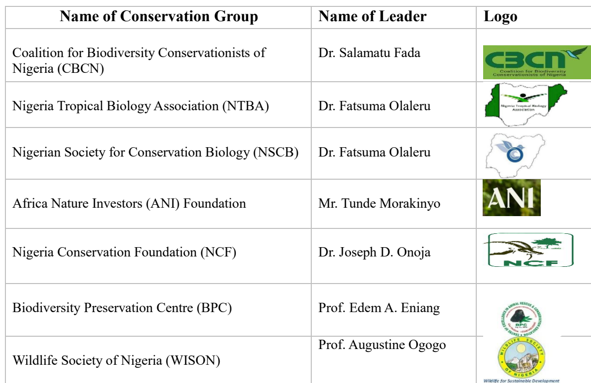
Table 1: List of organisations that have endorsed the content of the letter