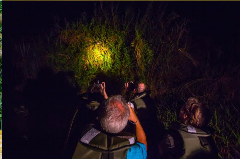
River Cruise - Kinabatangan