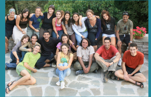
Participants in SCB Europe's Greek Summer School on Conservation Biology, 2008

Founded by some of the most influential conservation leaders of our time, we band together under the common cause of furthering the use of proven science – in policy and in management decision-making. Our community of thousands is present in more than 140 countries.