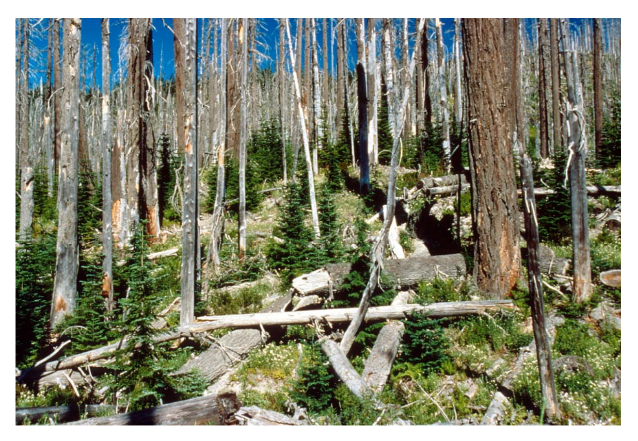
Figure 4. Structural biological legacies (snags and down logs).